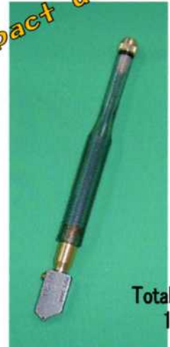
Total length 163mm