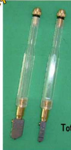
Total length 165mm