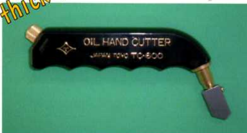
Total length 150mm