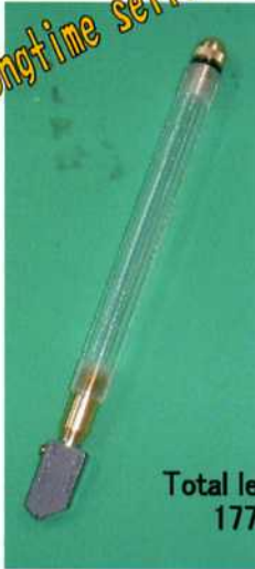
Total length 177mm